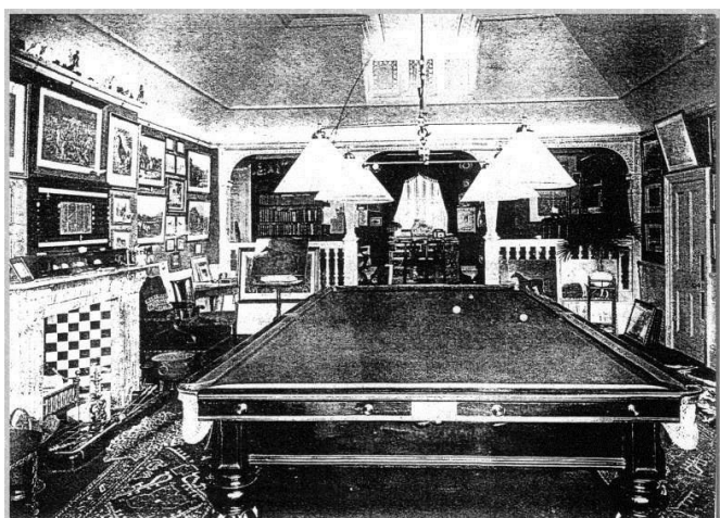
The Billiard Room at Barton Court