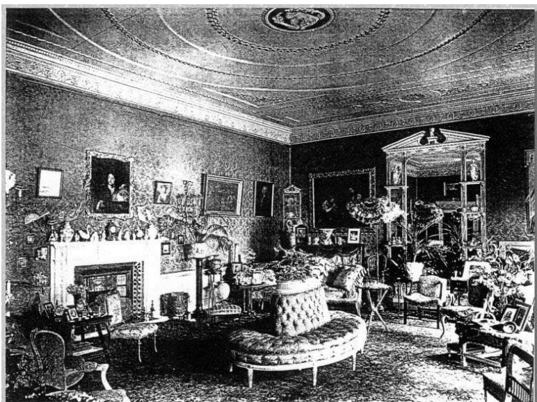
The Drawing Room at Barton Court