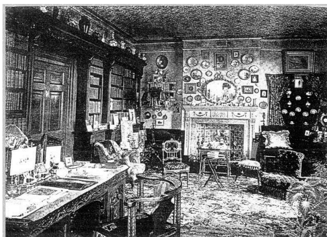
The Study at Barton Court

Much of the estate was bought by members of the Ballard family who became the largest landowners in Colwall. Other parts were split up and purchased by private people, but Barton Court and that part of the estate at the southern end of Colwall were retained by the Bright family.