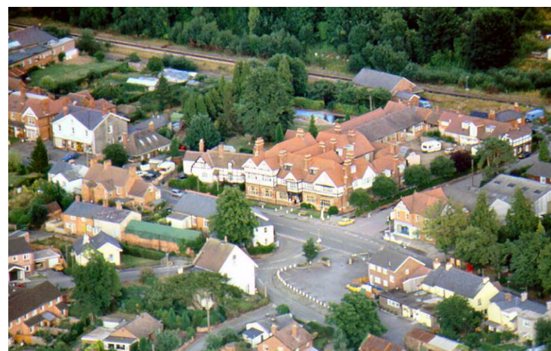
Aerial View of Colwall Park Hotel - 1983