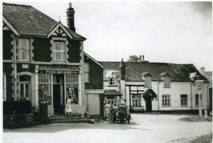
Pedlingham's Shop, Colwall Green