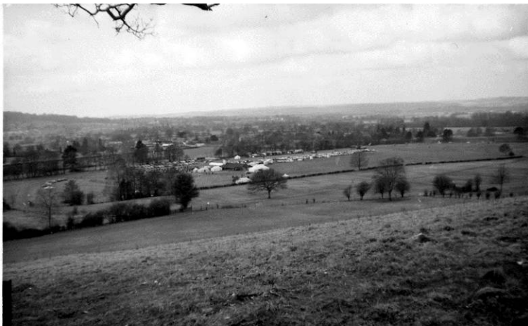
Colwall Race Course from just above Sally Beds, Evendine

Colwall Park Racecourse is situated close to the railway station: four meetings are held annually for steeple-chase and hurdle racing. Kilbury Camp, the Herefordshire Beacon and the Malvern Hills are objects of local interest. An eighteen-hole golf course was laid out on the Old Castle Banks in 1912, and a club house was erected in 1913, but has now ceased to exist. The Colwall Stone is possibly the remains of an ancient cross; a similar stone can also be seen in the church-yard, but is in a better state of preservation. Near the Herefordshire Beacon is the house once the residence of the late Madame Lind-Goldschmidt ("Jenny Lind"). Hope End, destroyed by fire in 1911 was a noble modern mansion, occupying a commanding position between Malvern and Ledbury: it